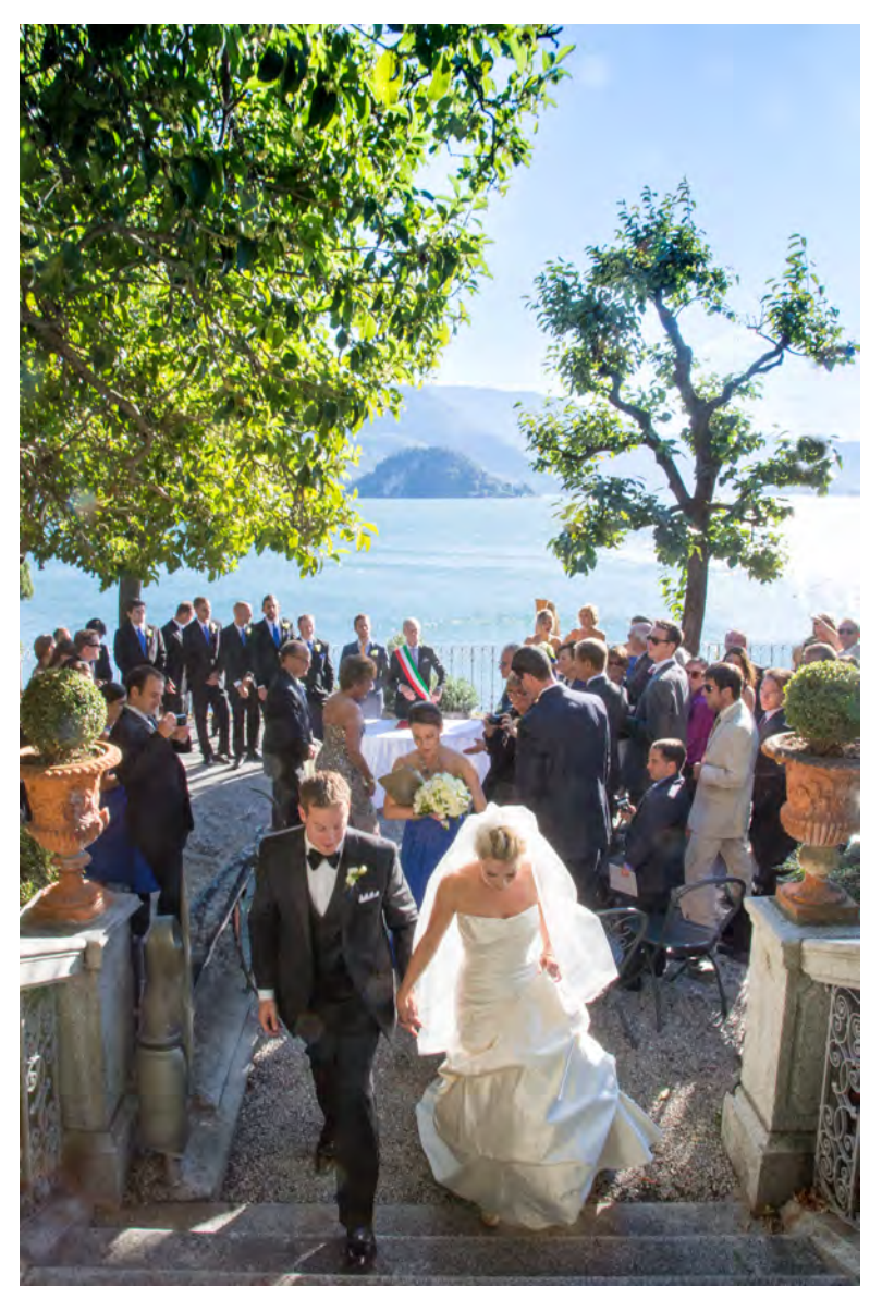
Lake Como, Italy